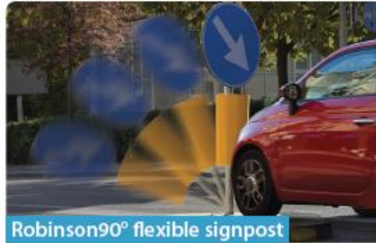
Robinson90° flexible signpost